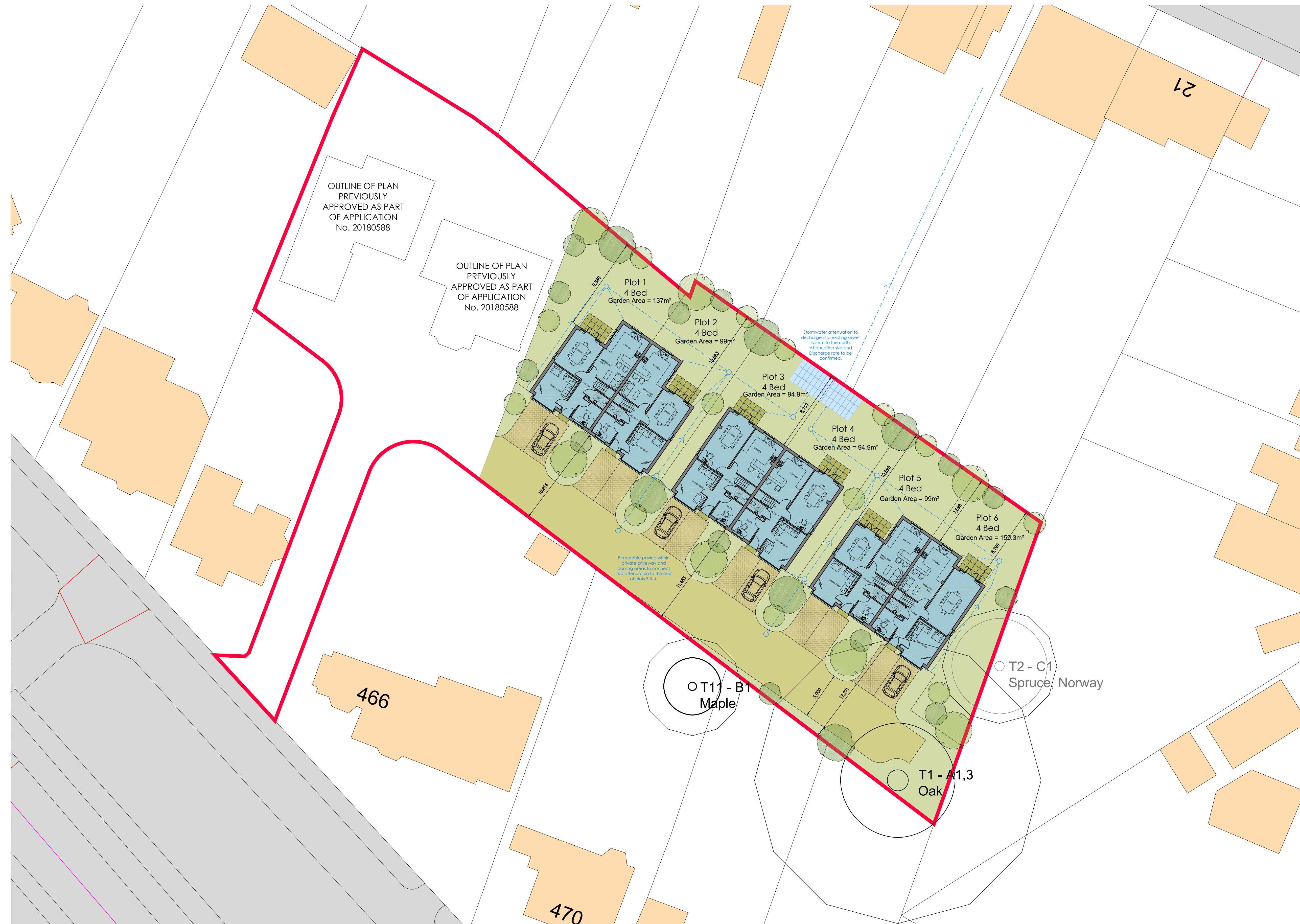
Proposed Ground Floor Site Plan Scale 1:200